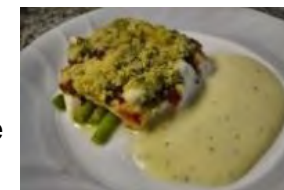
Baked Cod Fillet with Tartare Sauce