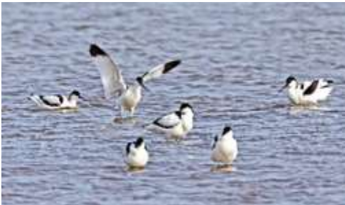
Avocet group