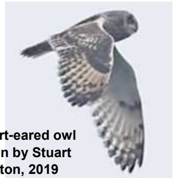
Short-eared owl taken by Stuart Carlton, 2019