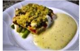
Potatoes and Seasonal Vegetables