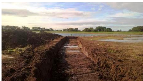
Trench waiting for reeds

The top part of reserve is still closed unfortunately whilst the grass seed around the outfall sluice establishes. If we open it at this time of year, the bare muddy area will soon turn into a quagmire. The sluice is (in theory) now fully operational and will be put to the test as river levels increase during the winter period.