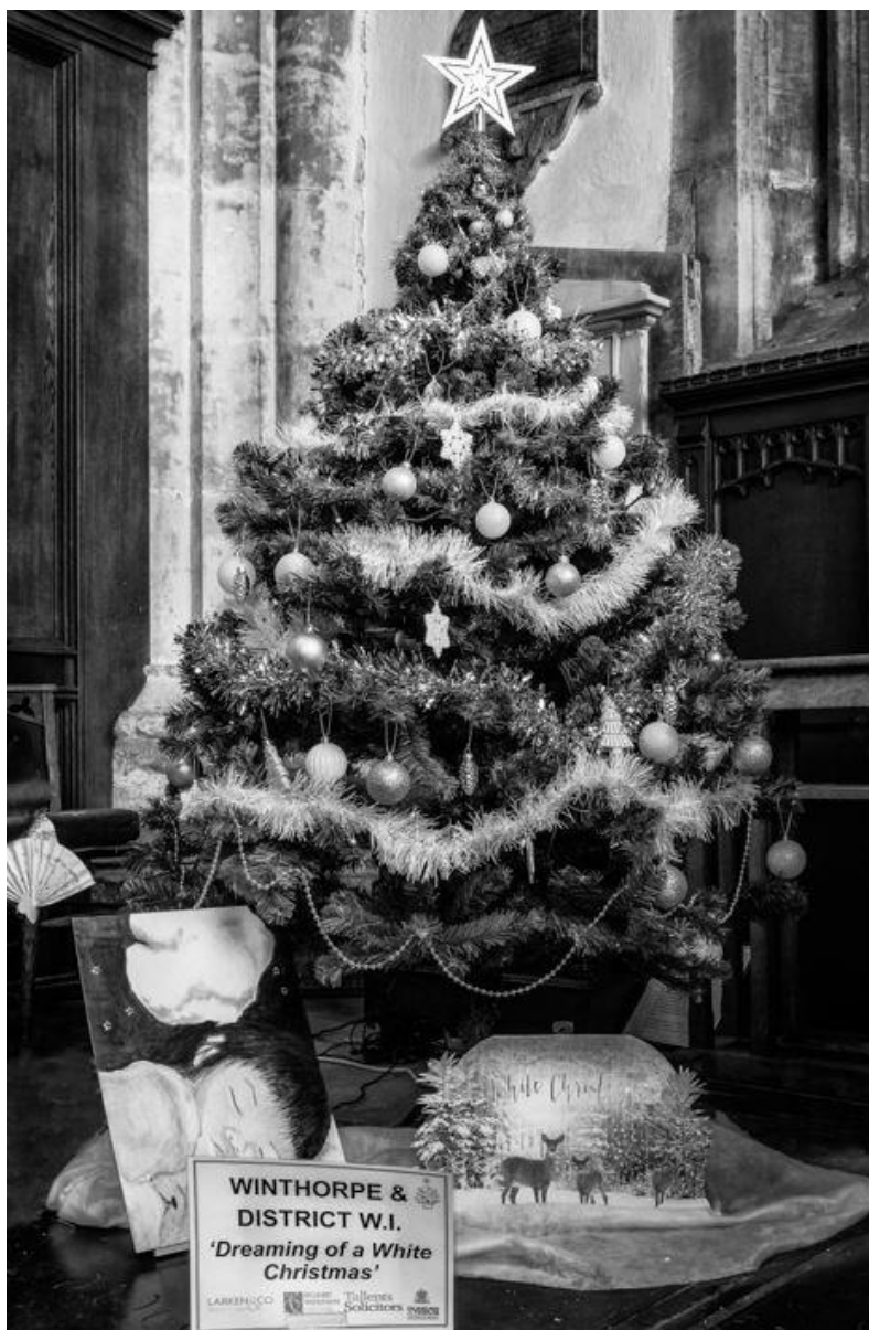
Christmas Tree