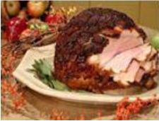
Baked Ham and Pineapple with a Red Wine Sauce

The February Lunch Club will be at 12.30 p.m. on Monday 5th February at the Community Centre. The menu will be: