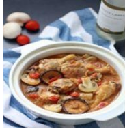
Breast of Chicken Chasseur

The September Lunch Club will be at 12.30 p.m. on Monday 4th September at the Community Centre. The menu will be: