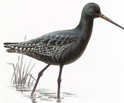
Spotted redshank by Mike Langman (rspb-images.com)

As April drew to a close the last few summer visitors were still arriving with cuckoo song reverberating around the reserve and a grasshopper warbler