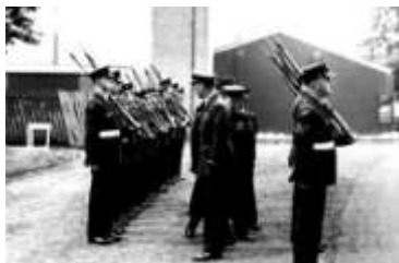
The Closing Parade for RAF Winthorpe in the

At Christmas 2011 Newark Air Museum sought assistance in connection with RAF Winthorpe, which was opened in September 1940. Good feedback was received for the wartime era, but the museum's researcher