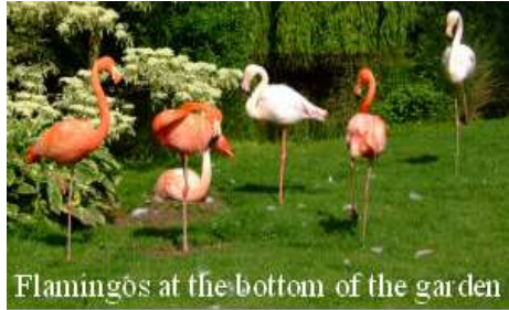
Flamingos at the bottom of the garden