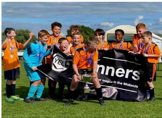
2022 Winners of YEL under 11s Nottinghamshire cup!

Come along to our home ground on Stapleford Lane, near Coddington Roundabout, where you will receive a warm welcome for your son / daughter to have fun, make new friends and learn all the basic football skills in a safe setting.