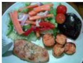
Mixed Fish Salad