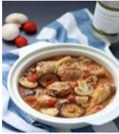
Chicken Breast Chasseur