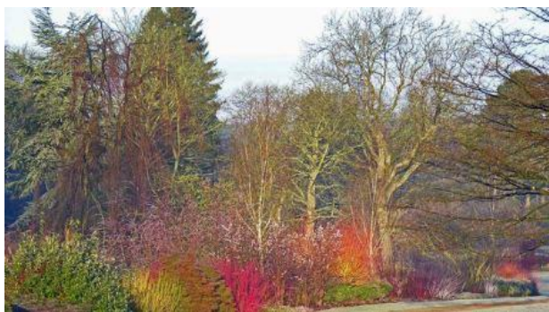
Harlow Carr in Yorkshire

Lists were distributed giving numerous plants from the Asters ( frikartii jungfrau) to Euphorbia ceratocarpa , miscanthus and Stipa calamagrostis . We were encouraged to look for varieties of leaf, berry and bark, all giving amounts of colour during a dark time of the year. Leaf pictures featured bright red acers, to berries which were cotoneasters and pyracantha through to barks like the Tibetan cherry in silver.