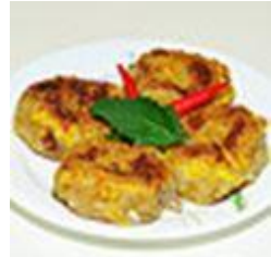
Fishcakes with Parsley Sauce