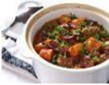
Sausage and Bacon Casserole