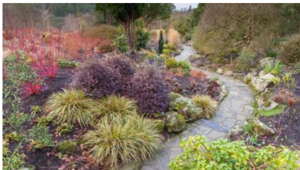
Bodnant in North Wales

His excellent address was around the theme of the ‘Hardy Planter’ surviving the four darkest months of the year, assisted by the colours from the plants available in the wintertime.