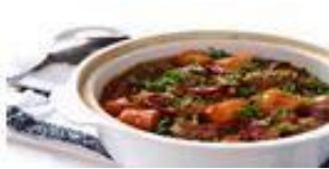
Sausage and Bacon Casserole

The November Lunch Club will be at 12.30 p.m. on Monday 6th November at the Community Centre. The menu will be: