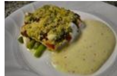
Baked Cod Fillet with Parsley Sauce