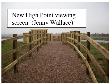
New High Point viewing screen (Jenny Wallace)